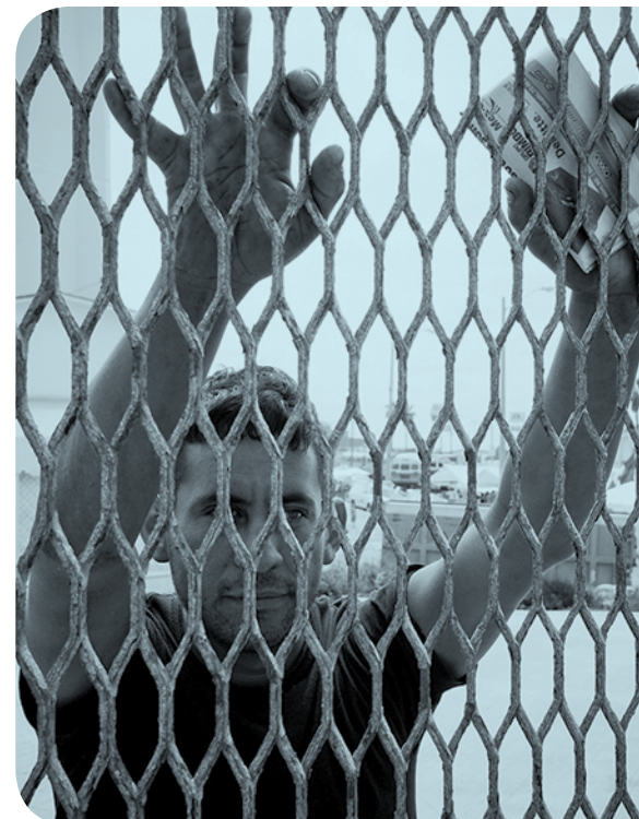
US/Mexico Border, USA

It's getting the data and knowing the questions that are the issues. You can combine information from different sources into a single map. We're not addressing hypotheses in the scientific sense; we're using the empirical research tools and research designs to build evidence that will help bring social change.