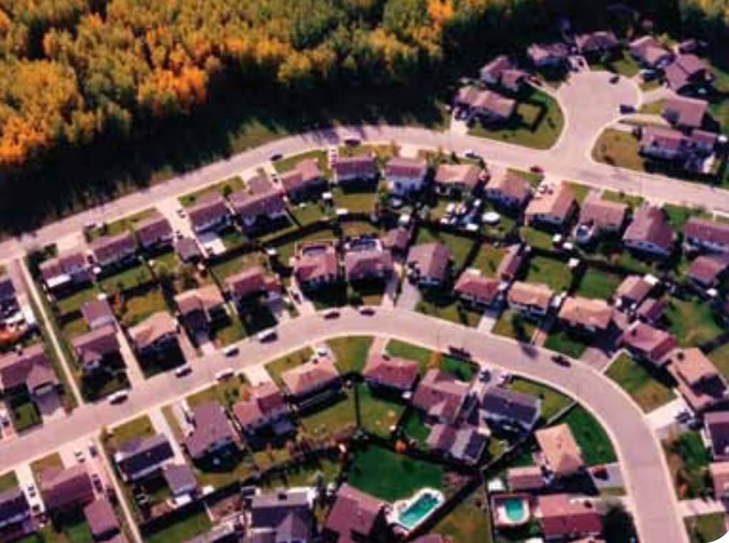
Fort McMurray, Canada