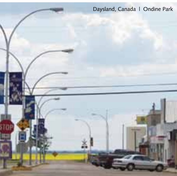
Daysland, Canada

This community of communities has demonstrated both the need for partnering and the way forward to achieving it. Diversity is an important ingredient in creating productive partnerships, presenting challenges, but also providing the impetus to come together.