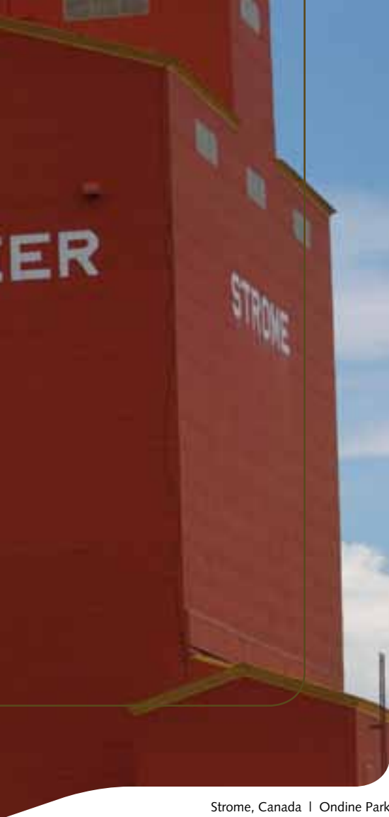
Strome, Canada | Ondine Park

"We have ... the mindset that we are working towards the same set of goals."